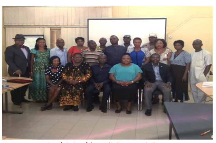
Beneficiaries of the mediation course in Enugu

In order to achieve this the J4A programme organized mediation skills courses for artisans in Anambra, Enugu, FCT, Kano and Lagos States in April and May 2014 respectively. Five different artisan groups from each of the states were trained. Mentoring visits were also provided through ADR experts over a one year period.