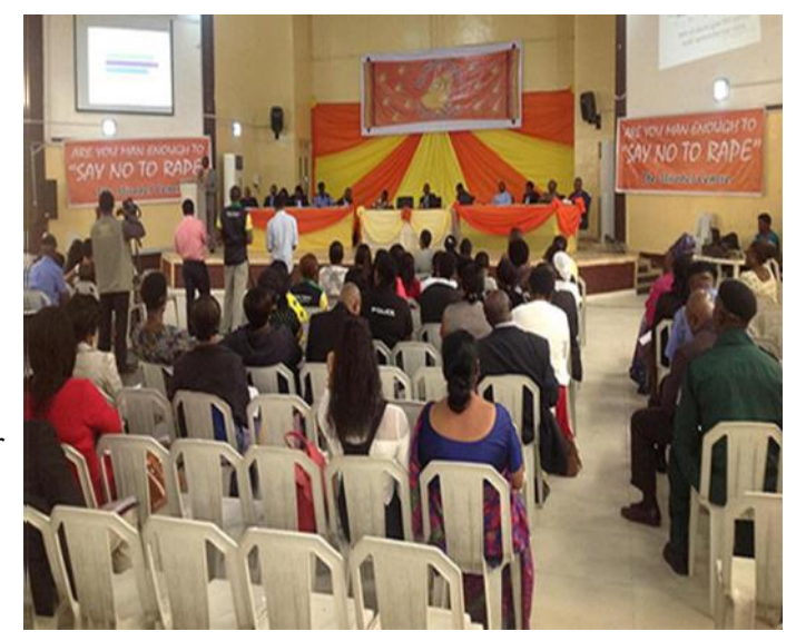
Guests at the "Say No to Rape" conference organized by the Mirabel Centre to mark its 2nd anniversary

The centre has dealt with over 740 cases including rape, defilement and sexual assault since its inception in July 2013 and 76% of the cases involve children under the age of 17 years.