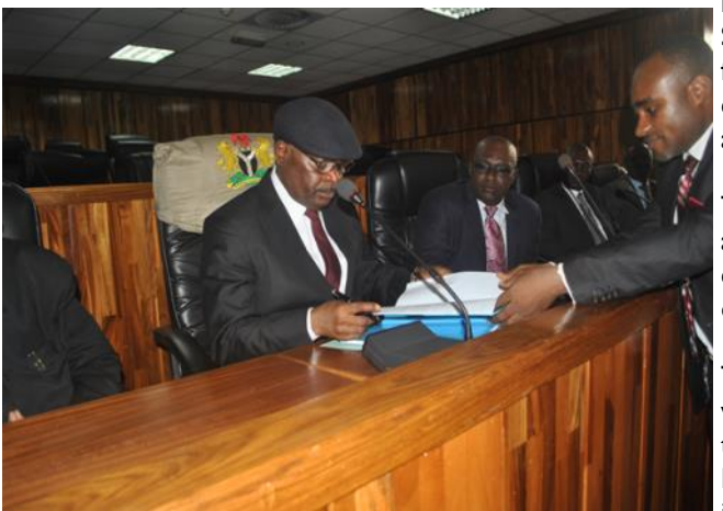
Justice Ishaq Bello signing the family court rules for FCT

The Chief Judge of the Federal Capital Territory (FCT), Justice Ishaq Bello, has signed the family court rules, which will regulate the enforcement of the Child Rights Act within the FCT. This follows the drafting of the rules and advocacy for its