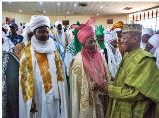
Northern Traditional Rulers and the Governor of Jigawa State, at the Traditional Rulers Summit

The summit provided an opportunity for the leaders of the formal justice system (represented by the Attorneys Generals and representatives from the JRTs) to have a better understanding of the informal justice system and how it complements the formal justice system.